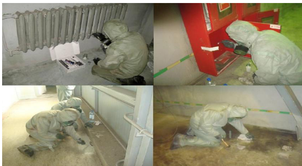
Fig. Sampling at the chemical weapons destruction facilities

The data obtained were processed with STATISTICA 13.3 (StatSoft Inc.; USA).